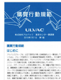
Purchasing Code of Conduct